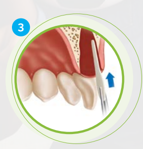
A protective membrane may be placed in the socket before adding bone grafting material.