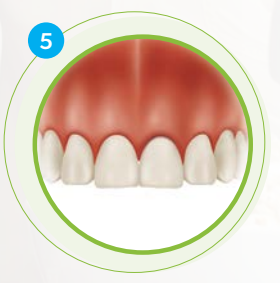
Allow approximately 3 to 5 months for healing.