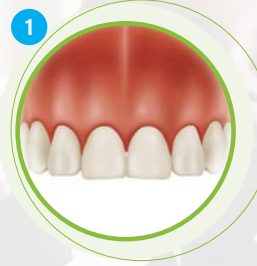
A local anesthetic is applied to the surgical site.

Prior to your procedure, your doctor will go over any preoperative instructions you should follow, as well as any specifics about the surgical process. The following general steps may be included: