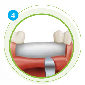
The area is stabilized with a protective covering.