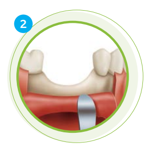
A small opening is made in the area where bone is needed.