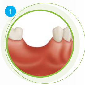
A local anesthetic is applied to the grafting site.

Prior to your procedure, your doctor will go over any pre-operative instructions you should follow, as well as any specifics about the surgical process. The following general steps may be included: