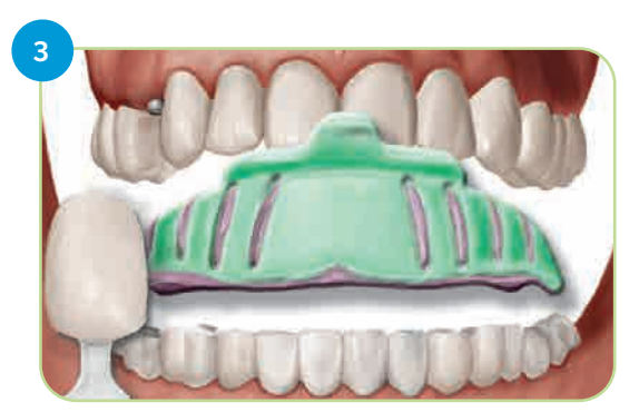
Take an impression of the opposing arch and bite registration.