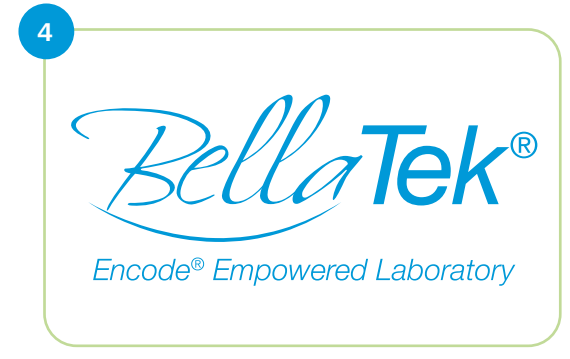
Select shade for crown. Disinfect and package the impressions and send to your Encode Empowered Laboratory for definitive abutment design.

Note: Larger\ cases\ of\ three\ or\ more\ units\ should\ include\ a\ diagnostic\ wax\ up.\ A\ metal\ or\ resin\ framework\ try-in\ is\ recommended\ for\ multi-unit\ cases.