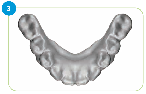
Scan the opposing arch and bite registration.