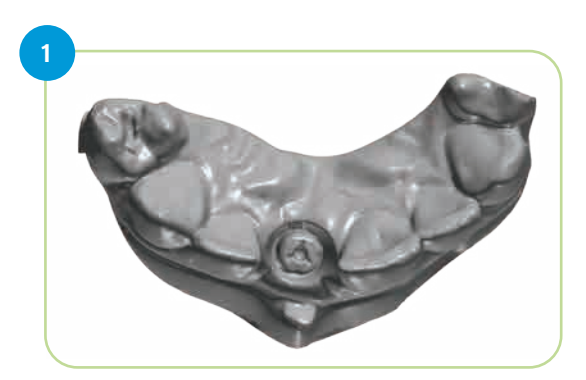
Scan the TSV BellaTek Encode Healing Abutment with an intraoral scanner following the manufacturer's instructions.