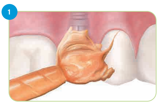
Use a light body impression material around the healing abutment(s) and a medium body elastomeric impression material (polyether or polyvinyl) in the impression tray and seat in the mouth.